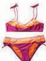
2 piece Bathing Suit