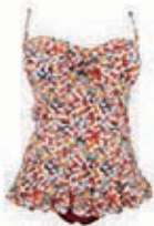
2 piece Tankini